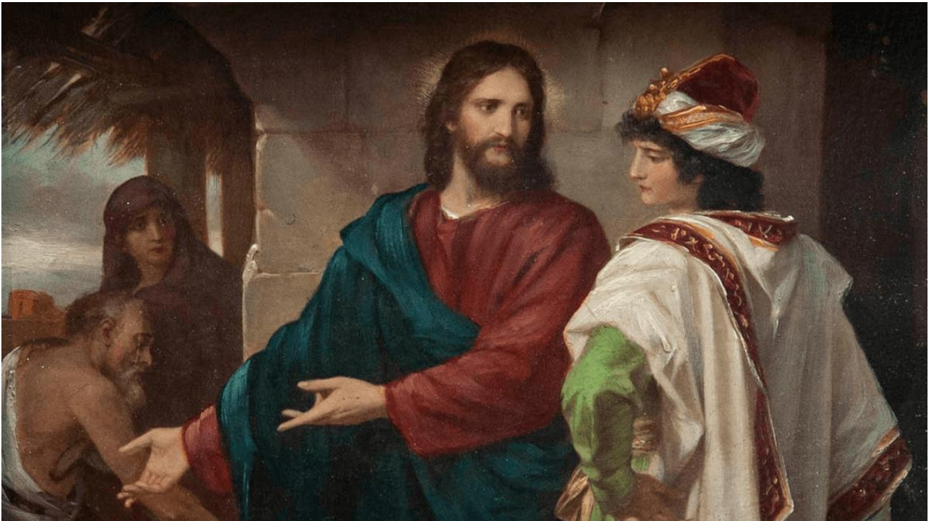
Heinrich Hofmann | 1888 | Christ and the Rich Young Ruler | Brigham Young University Museum of Art | PD-US

28 Peter began to say to him, “We have given up everything and followed you.” 29 Jesus said, “Amen, I say to you, there is no one who has given up house or brothers or sisters or mother or father or children or lands for my sake and for the sake of the gospel 30 who will not receive a hundred times more now in this present age: houses and brothers and sisters and mothers and children and lands, with persecutions, and eternal life in the age to come. 31 But many that are first will be last, and (the) last will be first.”