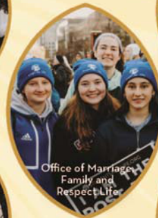
Office of Marriage, Family and Respect Life