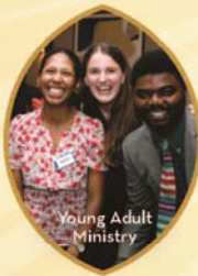
Young Adult Ministry