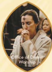
Office of Divine Worship

For more information, please call the Bishop's Lenten Appeal office at 703-841-2570 or visit our website at