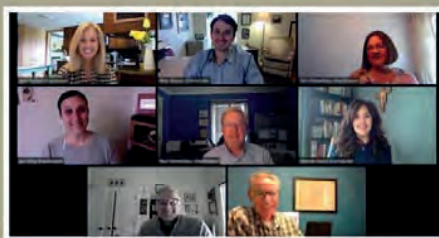
Talk about the message in a small group