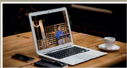
Watch an engaging video message

Seek answers at Discovering Christ Online.